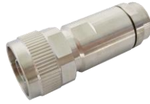
NC7-MB-B1200-1 7-16 male, Ternary alloy plated brass